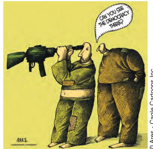
Seeing the democracy