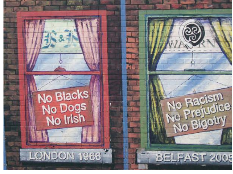
In some societies of Northern Ireland, the colonies of Protestant and Catholic communities are divided by walls. These walls are sometimes filled with graffiti as you can see here. The Irish Republican Army and British Government signed an agreement in 2005. What does the graffiti here tell about the conflict in the society?

Second, it depends on how political leaders raise the demands of any community. It is easier to accommodate demands that are within the constitutional framework and are not at the cost of another community.