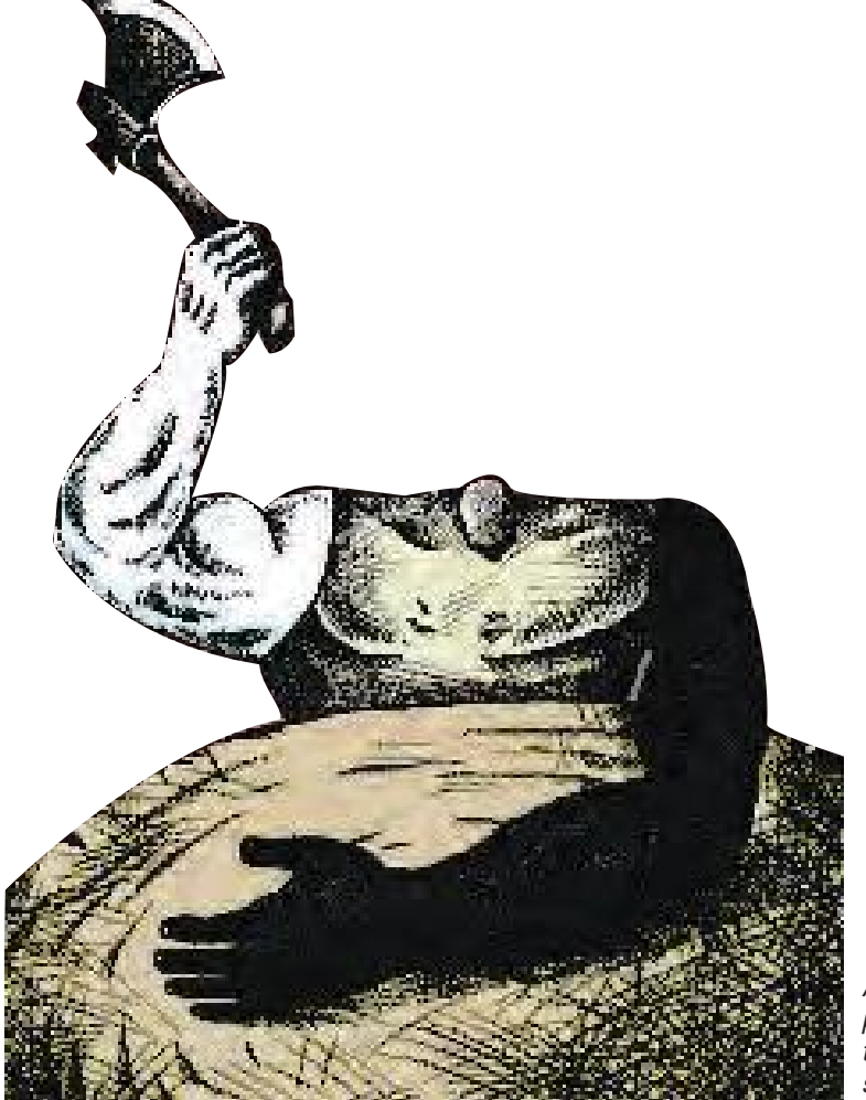
A cartoon like this can be read by different people to mean different things. What does this cartoon mean to you? How do other students in your class read this?

It is fairly common for people belonging to the same religion to feel that they do not belong to the same community, because their caste or sect is very different. It is also possible for people from different religions to have the same caste and feel close to each other. Rich and poor persons from the same family often do not keep close relations with each other for they feel they are very different. Thus, we all have more than one identity and can belong to more than one social group. We have different identities in different contexts.