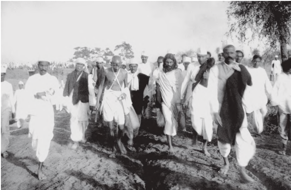
Fig. 7 – The Dandi march. During the salt march Mahatma Gandhi was accompanied by 78 volunteers. On the way they were joined by thousands.

with the British, as they had done in 1921-22, but also to break colonial laws. Thousands in different parts of the country broke the salt law, manufactured salt and demonstrated in front of government salt factories. As the movement spread, foreign cloth was boycotted, and liquor shops were picketed. Peasants refused to pay revenue and chaukidari taxes, village officials resigned, and in many places forest people violated forest laws – going into Reserved Forests to collect wood and graze cattle.