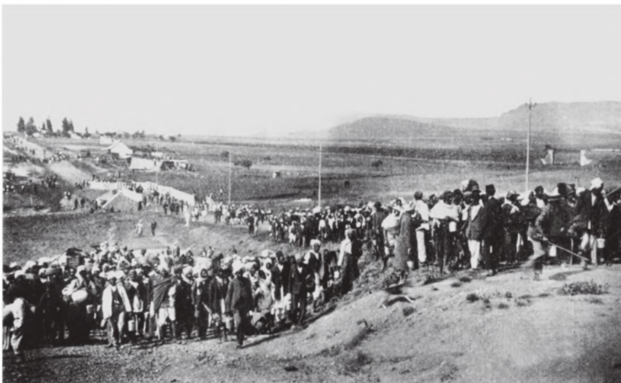
Fig. 2 – Indian workers in South Africa march through Volksrust, 6 November 1913.

Mahatma Gandhi returned to India in January 1915. As you know, he had come from South Africa where he had successfully fought