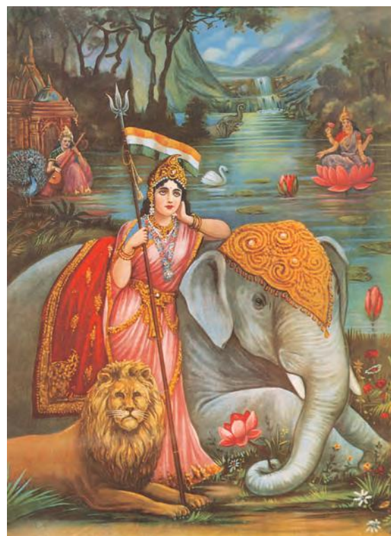
Fig. 14a – Bharat Mata.

This figure of Bharat Mata is a contrast to the one painted by Abanindranath Tagore. Here she is shown with a trishul, standing beside a lion and an elephant – both symbols of power and authority.