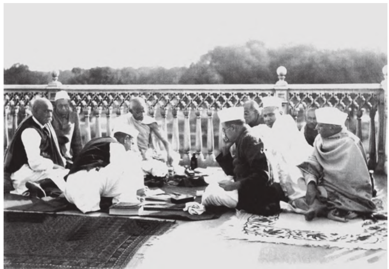
Fig. 6 – Meeting of Congress leaders at Allahabad, 1931. Apart from Mahatma Gandhi, you can see Sardar Vallabhbhai Patel (extreme left), Jawaharlal Nehru (extreme right) and Subhas Chandra Bose (fifth from right).

Lala Lajpat Rai was assaulted by the British police during a peaceful demonstration against the Simon Commission. He succumbed to injuries that were inflicted on him during the demonstration.