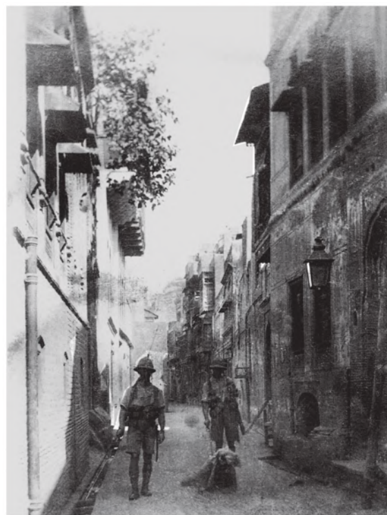
Fig. 3 – General Dyer's 'crawling orders' being administered by British soldiers, Amritsar, Punjab, 1919.

In his famous book Hind Swaraj (1909) Mahatma Gandhi declared that British rule was established in India with the cooperation of