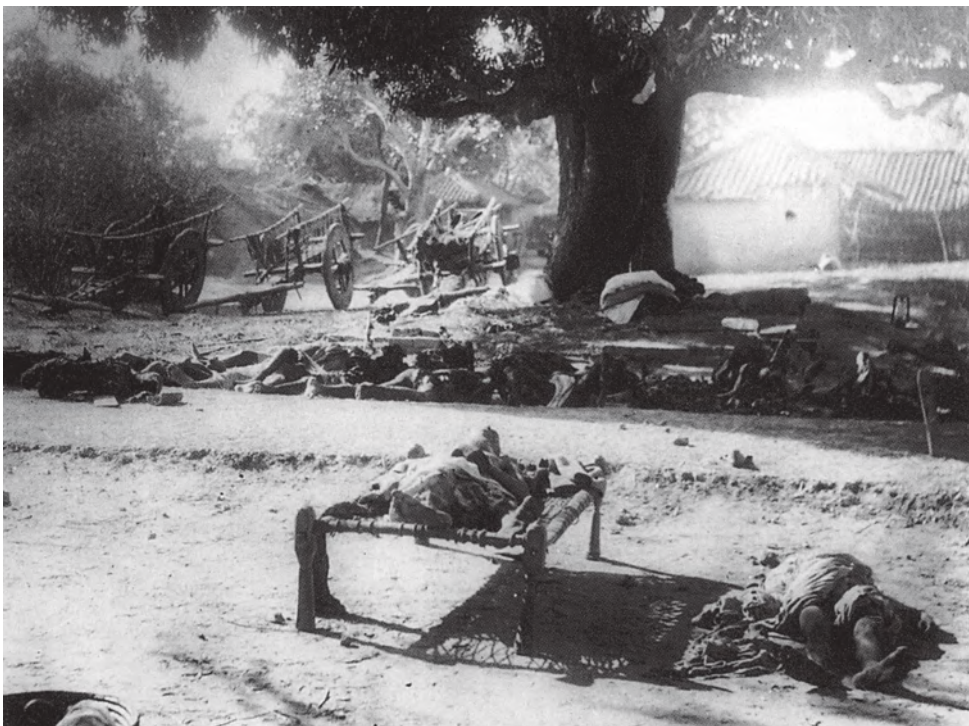
Fig. 5 – Chauri Chaura, 1922.

The visions of these movements were not defined by the Congress programme. They interpreted the term swaraj in their own ways, imagining it to be a time when all suffering and all troubles would be over. Yet, when the tribals chanted Gandhiji's name and raised slogans demanding ' Swatantra Bharat ', they were also emotionally relating to an all-India agitation. When they acted in the name of Mahatma Gandhi, or linked their movement to that of the Congress, they were identifying with a movement which went beyond the limits of their immediate locality.