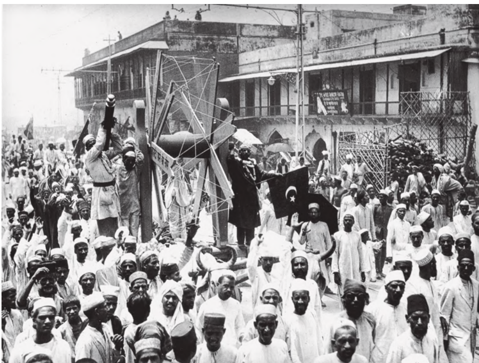
Fig. 4 – The boycott of foreign cloth, July 1922. Foreign cloth was seen as the symbol of Western economic and cultural domination.

Boycott – The refusal to deal and associate with people, or participate in activities, or buy and use things; usually a form of protest