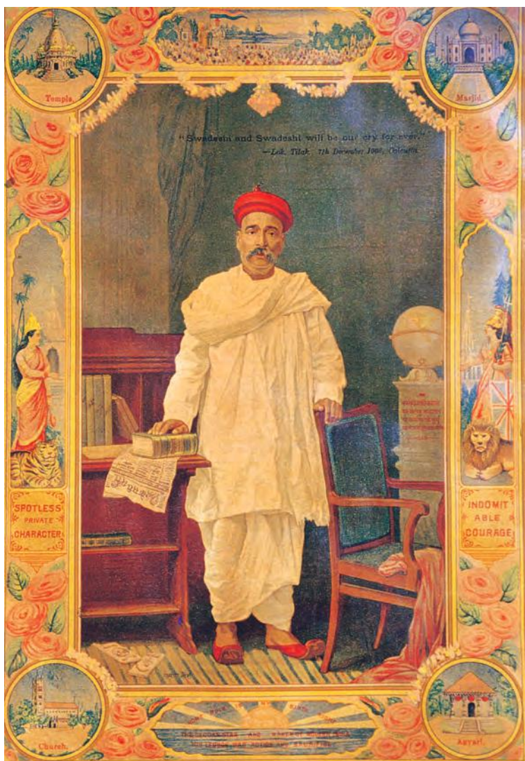
Fig. 11 – Bal Gangadhar Tilak, an early-twentieth-century print. Notice how Tilak is surrounded by symbols of unity. The sacred institutions of different faiths (temple, church, masjid) frame the central figure.

Nationalism spreads when people begin to believe that they are all part of the same nation, when they discover some unity that binds them together. But how did the nation become a reality in the minds of people? How did people belonging to different communities, regions or language groups develop a sense of collective belonging?