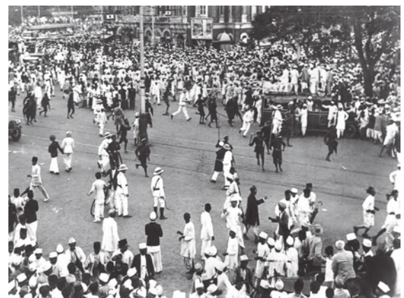
Fig. 8 – Police cracked down on satyagrahis, 1930.

In such a situation, Mahatma Gandhi once again decided to call off the movement and entered into a pact with Irwin on 5 March 1931. By this Gandhi-Irwin Pact, Gandhiji consented to participate in a Round Table Conference (the Congress had boycotted the first