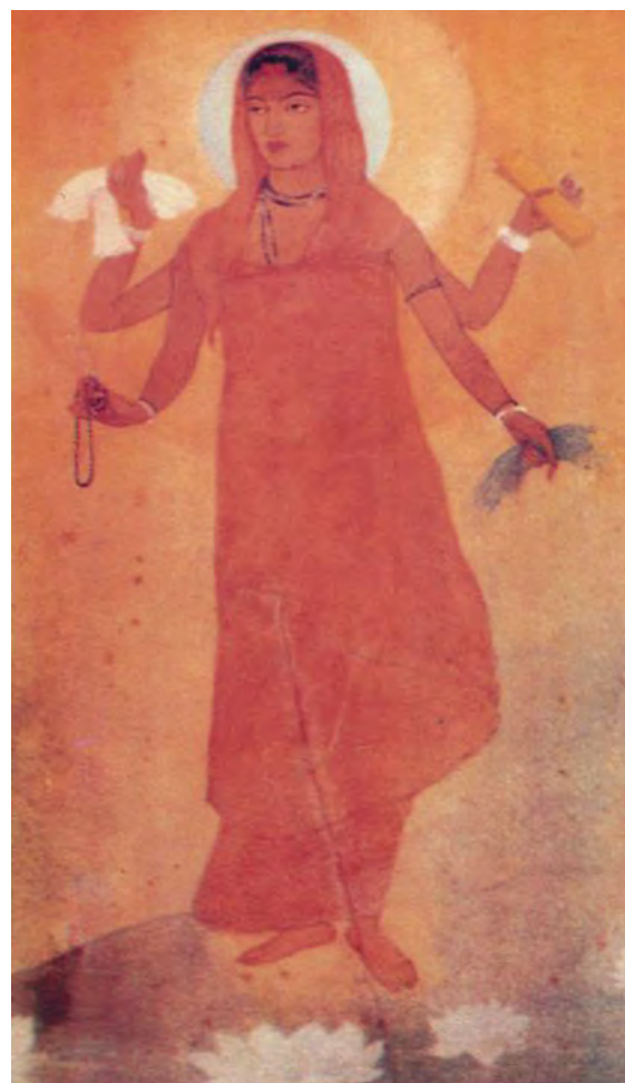
Fig. 12 – Bharat Mata, Abanindranath Tagore, 1905.

Ideas of nationalism also developed through a movement to revive Indian folklore. In late-nineteenth-century India, nationalists began recording folk tales sung by bards and they toured villages to gather folk songs and legends. These tales, they believed, gave a true picture of traditional culture that had been corrupted and damaged by outside forces. It was essential to preserve this folk tradition in order to discover one's national identity and restore a sense of pride in one's past. In Bengal, Rabindranath Tagore himself began collecting ballads, nursery rhymes and myths, and led the movement for folk