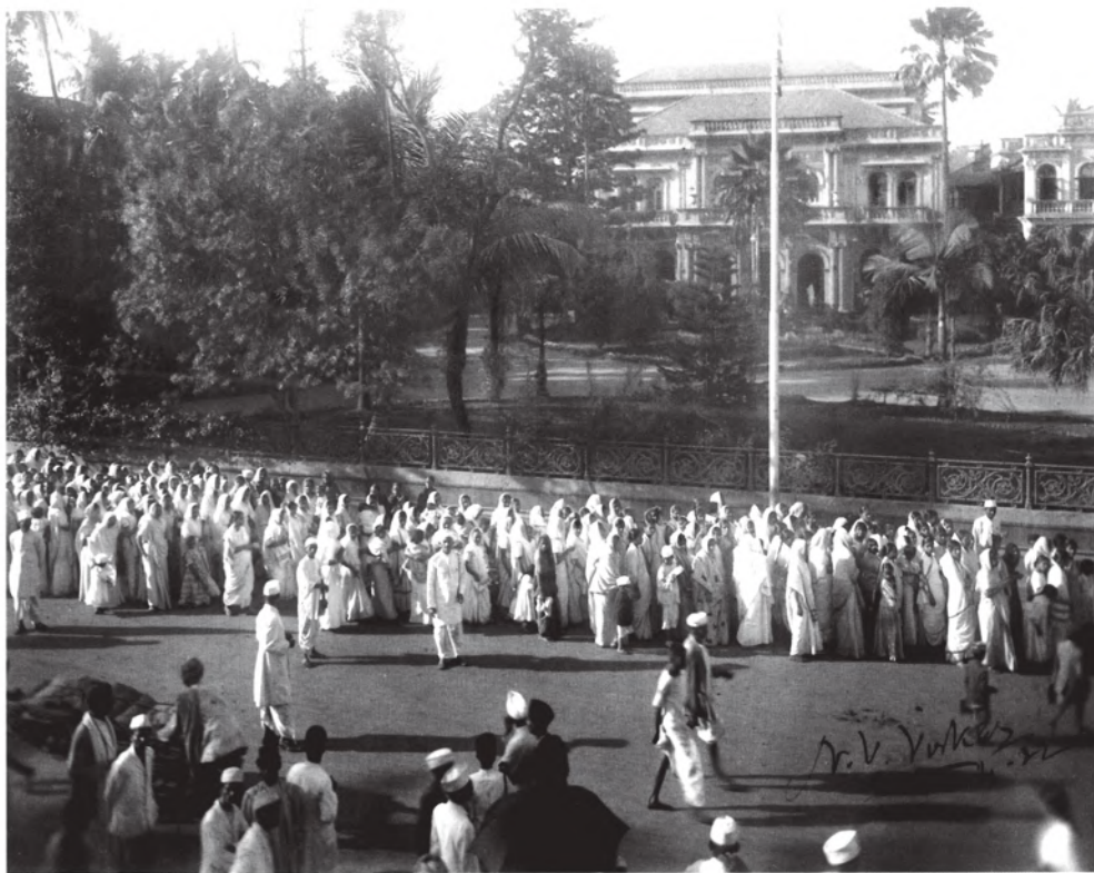
Fig. 9 – Women join nationalist processions. During the national movement, many women, for the first time in their lives, moved out of their homes on to a public arena. Amongst the marchers you can see many old women, and mothers with children in their arms.

picketed foreign cloth and liquor shops. Many went to jail. In urban areas these women were from high-caste families; in rural areas they came from rich peasant households. Moved by Gandhiji's call, they began to see service to the nation as a sacred duty of women. Yet, this increased public role did not necessarily mean any radical change in the way the position of women was visualised. Gandhiji was convinced that it was the duty of women to look after home and hearth, be good mothers and good wives. And for a long time the Congress was reluctant to allow women to hold any position of authority within the organisation. It was keen only on their symbolic presence.