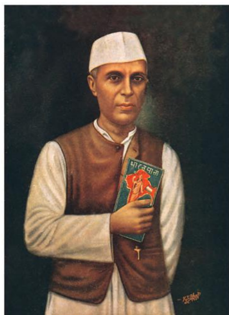
Fig. 13 – Jawaharlal Nehru, a popular print.

Notice that the mother figure here is shown as dispensing learning, food and clothing. The mala in one hand emphasises her ascetic quality. Abanindranath Tagore, like Ravi Varma before him, tried to develop a style of painting that could be seen as truly Indian.