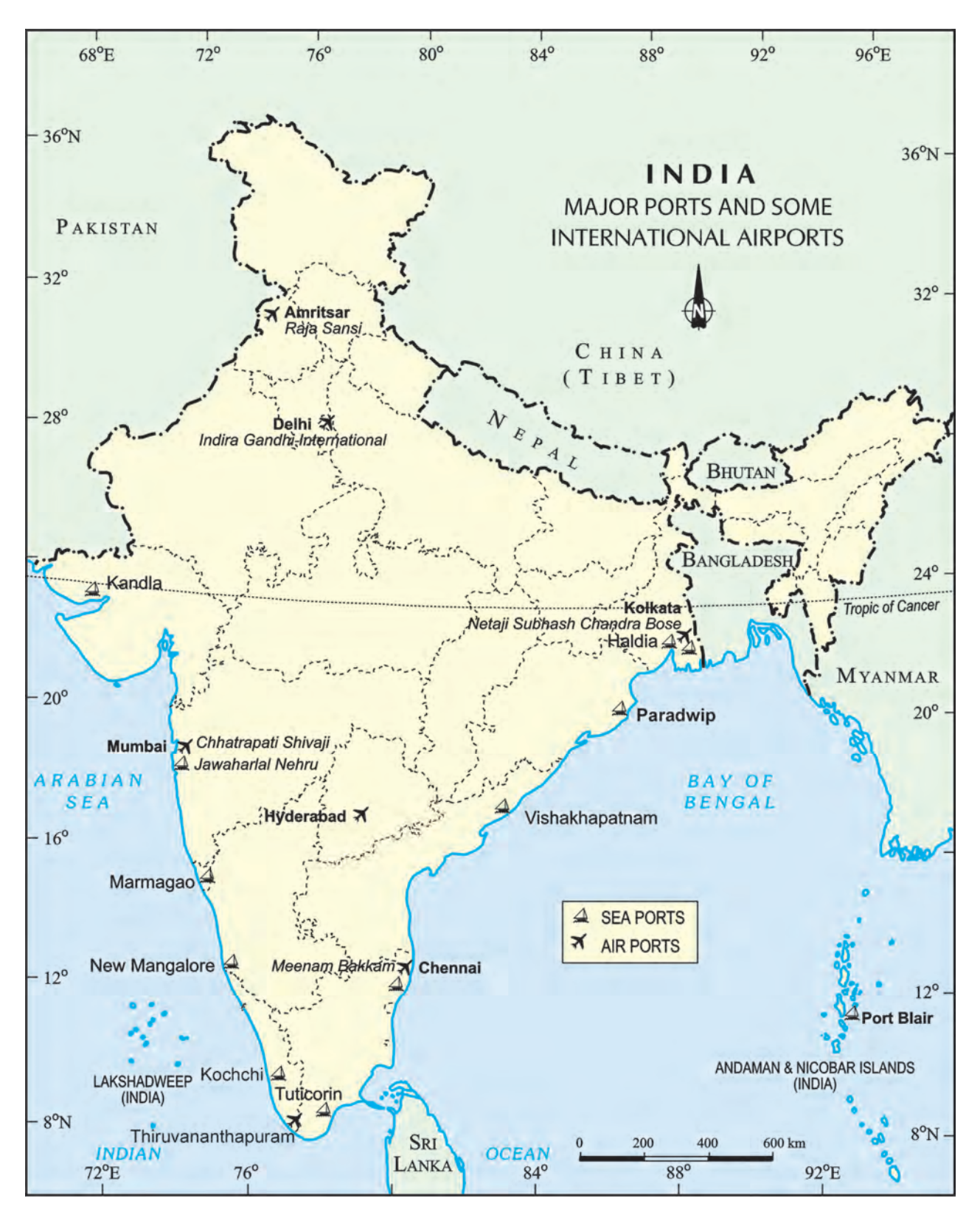
India: Major Ports and Some International Airports