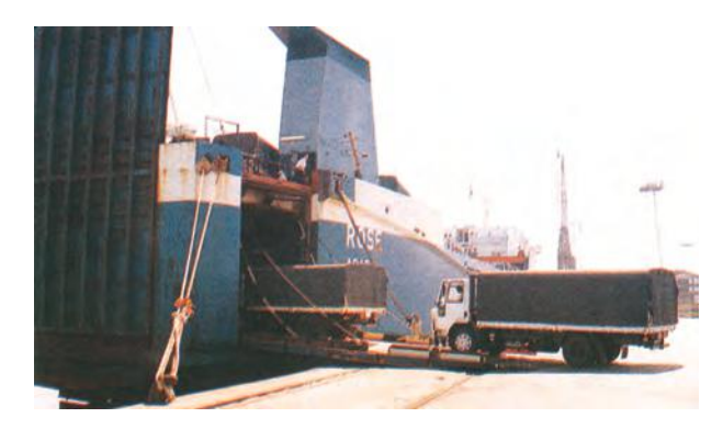
Fig. 7.6: Trucks being driven into the vessel at Mumbai port

Deendayal Port, is a tidal port. It caters to the convenient handling of exports and imports of highly productive granary and industrial belt stretching across the states of Jammu and Kashmir, Himachal Pradesh, Punjab, Haryana, Rajasthan and Gujarat.