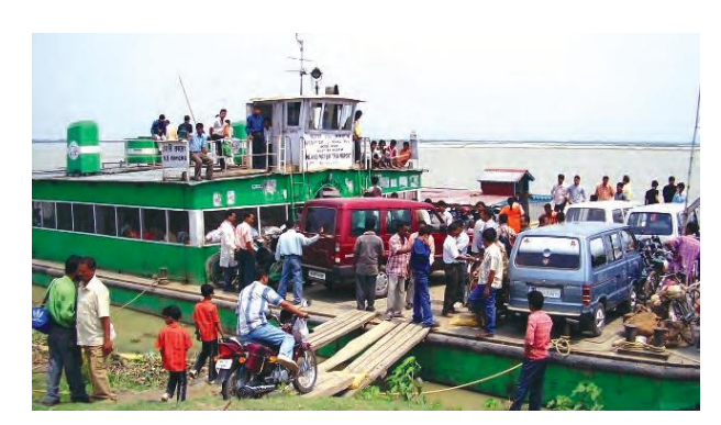
Fig. 7.5: Inland waterways widely used in north-eastern states