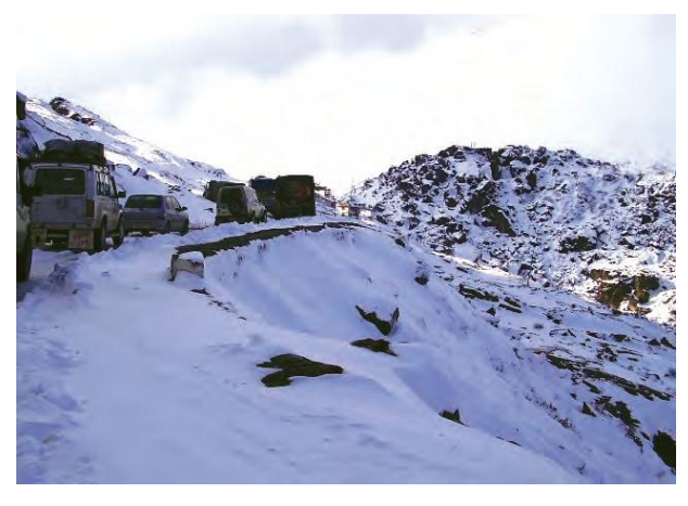
Fig. 7.4: Traffic on north-eastern border road (Arunachal Pradesh)

Roads can also be classified on the basis of the type of material used for their construction such as metalled and unmetalled roads. Metalled roads may be made of cement, concrete or even bitumen of coal, therefore, these are all weather roads. Unmetalled roads go out of use in the rainy season.