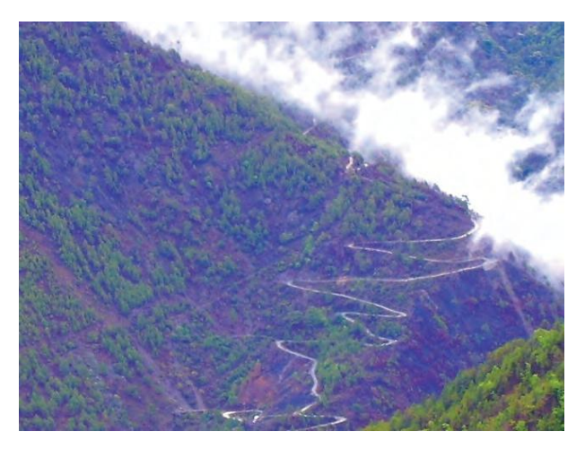
Fig. 7.3: Hilly Tracts

maintains roads in the bordering areas of the country. This organisation was established in 1960 for the development of the roads of strategic importance in the northern and north-eastern border areas. These roads have improved accessibility in areas of difficult terrain and have helped in the economic development of these area.