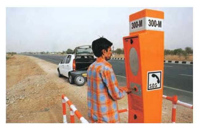
Fig.7.10: Emergency call box on NH-8

Digital India is an umbrella programme to prepare India for a knowledge based transformation. The focus of Digital India Programme is on being transformative to realise – IT (Indian Talent) + IT (Information Technology)=IT (India Tomorrow) and is on making technology central to enabling change.