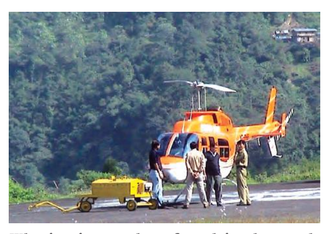
Why is air travel preferred in the northeastern states?

The air travel, today, is the fastest, most comfortable and prestigious mode of transport. It can cover very difficult terrains