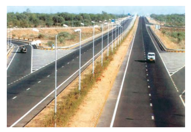
Fig.7.2: Ahmedabad- Vadodara Expressway

laid and maintained by the Central Public Works Department (CPWD). A number of major National Highways run in North-South and East-West directions. The historical Sher-Shah Suri Marg is called National Highway No.1, between Delhi and Amritsar.