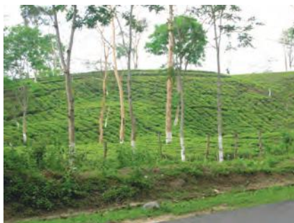
Fig. 4.10: Tea Cultivation

Coffee: Indian coffee is known in the world for its good quality. The Arabica variety initially brought from Yemen is produced in the country. This variety is in great demand all over the world. Initially its cultivation was introduced on the Baba Budan Hills and even today its cultivation is confined to the Nilgiri in Karnataka, Kerala and Tamil Nadu.