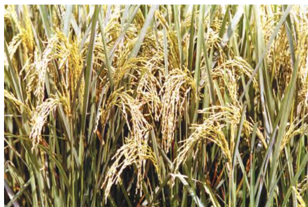
Fig. 4.4 (b): Rice is ready to be harvested in the field