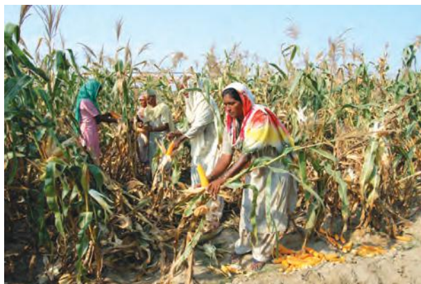
Fig. 4.7: Maize Cultivation

Maize: It is a crop which is used both as food and fodder. It is a kharif crop which requires temperature between 21°C to 27°C and grows well in old alluvial soil. In some states like Bihar maize is grown in rabi season also. Use of modern inputs such as HYV seeds, fertilisers and irrigation have contributed to the increasing production of maize. Major maize-producing states are Karnataka, Madhya Pradesh, Uttar Pradesh, Bihar, Andhra Pradesh and Telangana.