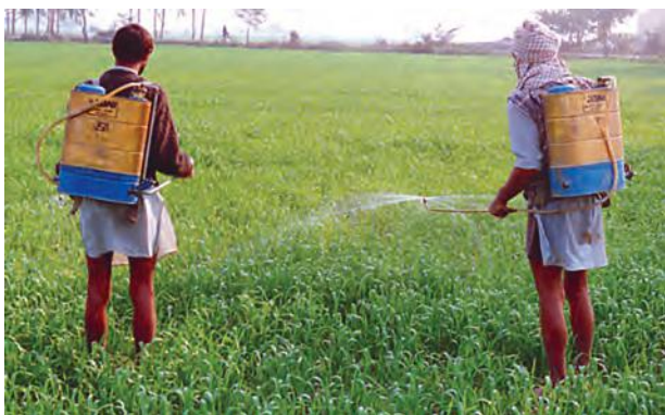
Fig. 4.17 Problems associated with heavy pesticide use are widely recognised in developed and developing countries

A few economists think that Indian farmers have a bleak future if they continue growing foodgrains on the holdings that grow smaller