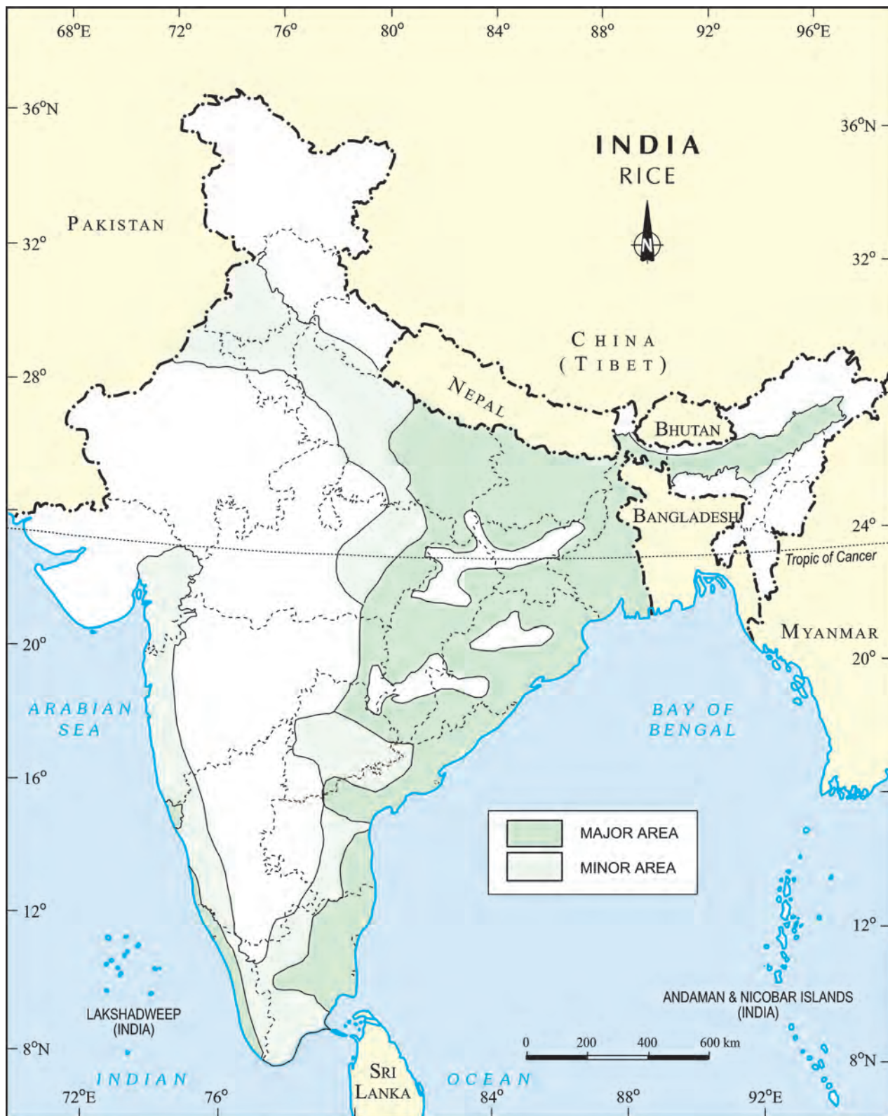
India: Distribution of Rice