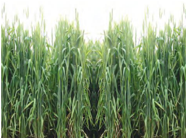
Fig. 4.5: Wheat Cultivation

Wheat: This is the second most important cereal crop. It is the main food crop, in north and north-western part of the country. This rabi crop requires a cool growing season and a bright sunshine at the time of ripening. It requires 50 to 75 cm of annual rainfall evenly-distributed over the growing season. There are two important wheat-growing zones in the country – the Ganga-Satluj plains in the north-west and black soil region of the Deccan. The major wheat-producing states are Punjab, Haryana, Uttar Pradesh, Madhya Pradesh, Bihar and Rajasthan.