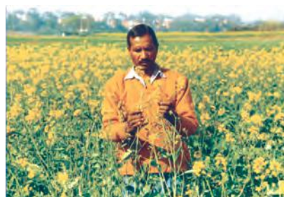
Fig. 4.9: Groundnut, sunflower and mustard are ready to be harvested in the field