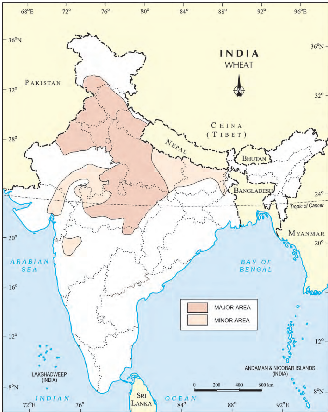
India: Distribution of Wheat