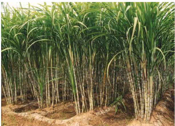
Fig. 4.8: Sugarcane Cultivation

Sugarcane: It is a tropical as well as a subtropical crop. It grows well in hot and humid climate with a temperature of 21°C to 27°C and an annual rainfall between 75cm. and 100cm. Irrigation is required in the regions of low rainfall. It can be grown on a variety of soils and needs manual labour from