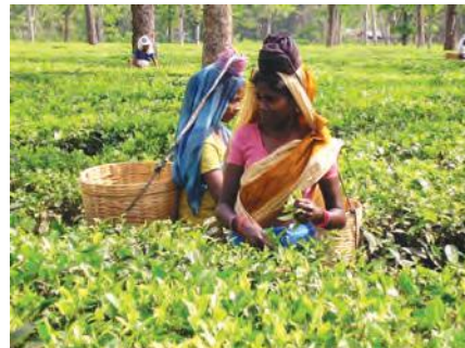
Fig. 4.11: Tea-leaves Harvesting

Horticulture Crops: In 2015, India was the second largest producer of fruits and vegetables in the world after China. India is a producer of tropical as well as temperate fruits. Mangoes of Maharashtra, Andhra Pradesh, Telangana, Uttar Pradesh and West Bengal, oranges of Nagpur and Cherrapunjee (Meghalaya), bananas of Kerala, Mizoram, Maharashtra and Tamil Nadu, lichi and guava of Uttar Pradesh and Bihar, pineapples of Meghalaya, grapes of Andhra Pradesh, Telangana and Maharashtra, apples, pears, apricots and walnuts of Jammu and Kashmir and Himachal Pradesh are in great demand the world over.