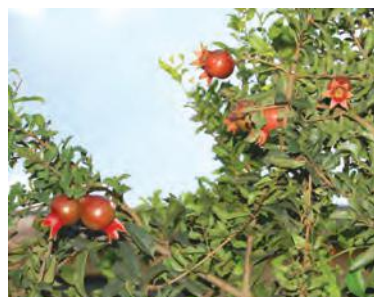
Fig. 4.12: Apricots, apple and pomegranate