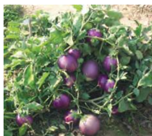
Fig. 4.13: Cultivation of vegetables – peas, cauliflower, tomato and brinjal