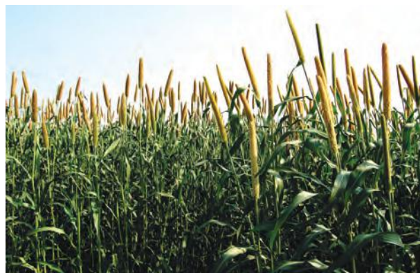
Fig. 4.6: Bajra Cultivation

Bajra grows well on sandy soils and shallow black soil. Major Bajra producing States are Rajasthan, Uttar Pradesh, Maharashtra, Gujarat and Haryana. Ragi is a crop of dry regions and grows well on red, black, sandy, loamy and shallow black soils. Major ragi producing states are: Karnataka, Tamil Nadu, Himachal Pradesh, Uttarakhand, Sikkim, Jharkhand and Arunachal Pradesh.