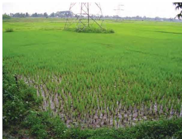
Fig. 4.4 (a): Rice Cultivation

Rice: It is the staple food crop of a majority of the people in India. Our country is the second largest producer of rice in the world after China. It is a kharif crop which requires high temperature, (above 25°C) and high humidity with annual rainfall above 100 cm. In the areas of less rainfall, it grows with the help of irrigation.