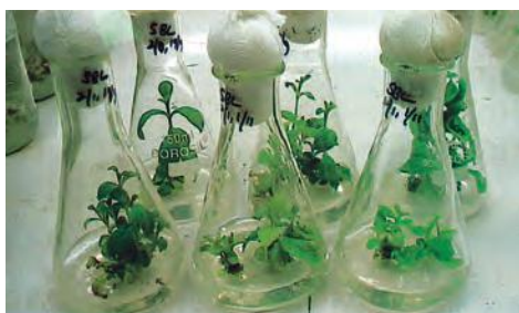
Fig. 4.16: Tissue culture of teak clones

countries because of the highly subsidised agriculture in those countries.