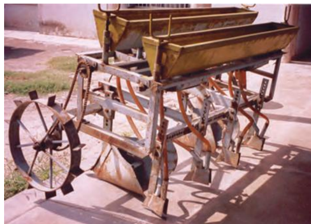
Fig. 4.15: Modern technological equipments used in agriculture

some of the strategies initiated to improve the lot of Indian agriculture. But, this too led to the concentration of development in few selected areas. Therefore, in the 1980s and 1990s, a comprehensive land development programme was initiated, which included both institutional and technical reforms. Provision for crop insurance against drought, flood, cyclone, fire and disease, establishment of Grameen banks, cooperative societies and banks for providing loan facilities to the farmers at lower rates of interest were some important steps in this direction.