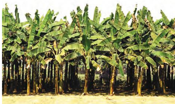
Fig. 4.2: Banana plantation in Southern part of India

In India, tea, coffee, rubber, sugarcane, banana, etc., are important plantation crops. Tea in Assam and North Bengal coffee in Karnataka are some of the important plantation crops grown in these states. Since the production is mainly for market, a well-developed network of transport and communication connecting the plantation areas, processing industries and markets plays an important role in the development of plantations.