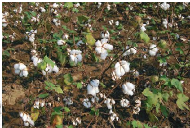
Fig. 4.14: Cotton Cultivation

Cotton: India is believed to be the original home of the cotton plant. Cotton is one of the main raw materials for cotton textile industry. In 2015, India was second largest producer of cotton after China. Cotton grows well in drier parts of the black cotton soil of the Deccan plateau. It requires high temperature, light rainfall or irrigation, 210 frost-free days and bright sun-shine for its